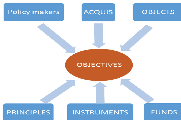
Figure No 1 – Acquis communautaire – legislative base the CAP. 59

The Common Agricultural Policy is the oldest EU policy. Its historical development started in 1962 and is being continuously developed until the present time. The CAP is the comprehensive system consisting of particular components with interrelations presented in the following Figure No 1.