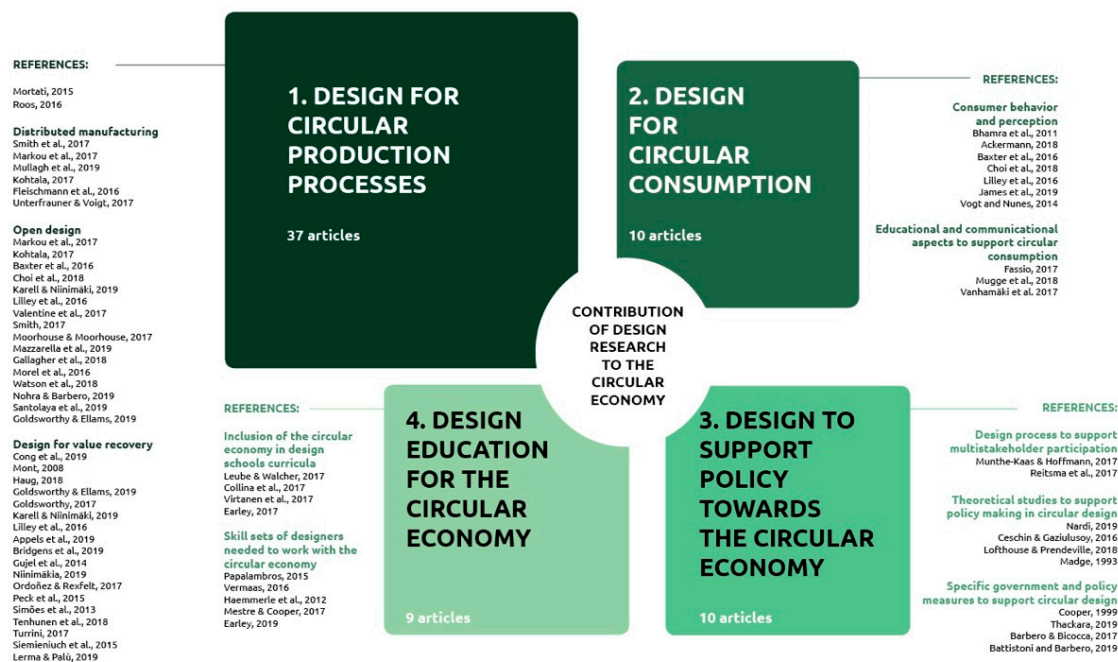
Figure 4. Thematic areas that emerged from the literature review.