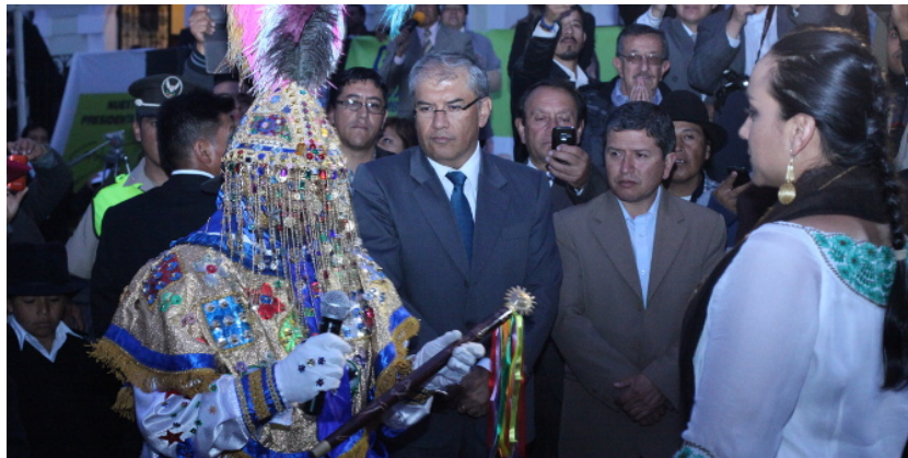
The President of Ecuador's National Assembly receives a baton representing “Living Well” from an indigenous leader in 2013

The need to protect ecosystems is felt particularly strongly in the Latin American setting because of the region's immense wealth in natural resources. After decades of violent struggle related to these resources, the peoples of Bolivia and Ecuador recently achieved recognition of the commons in their constitutions (of 2009 and 2008 respectively), where protection is inherent to ideas like “living well” ( buen vivir/vivir bien ), rights of nature, and collective goods.